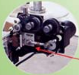
Batch or Date Code Printer